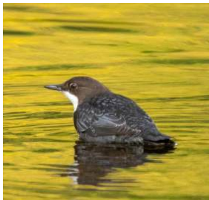
Dipper on the Coquet near the Hermitage.