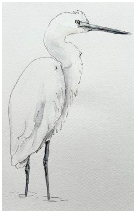
Text and drawing by Becky McMurray

This month's bird of the month is the little white egret