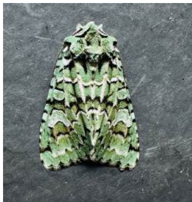
Merveille du Jour moth,. The moth's flight season is September - October with the larvae / caterpillar feeding on Oak.