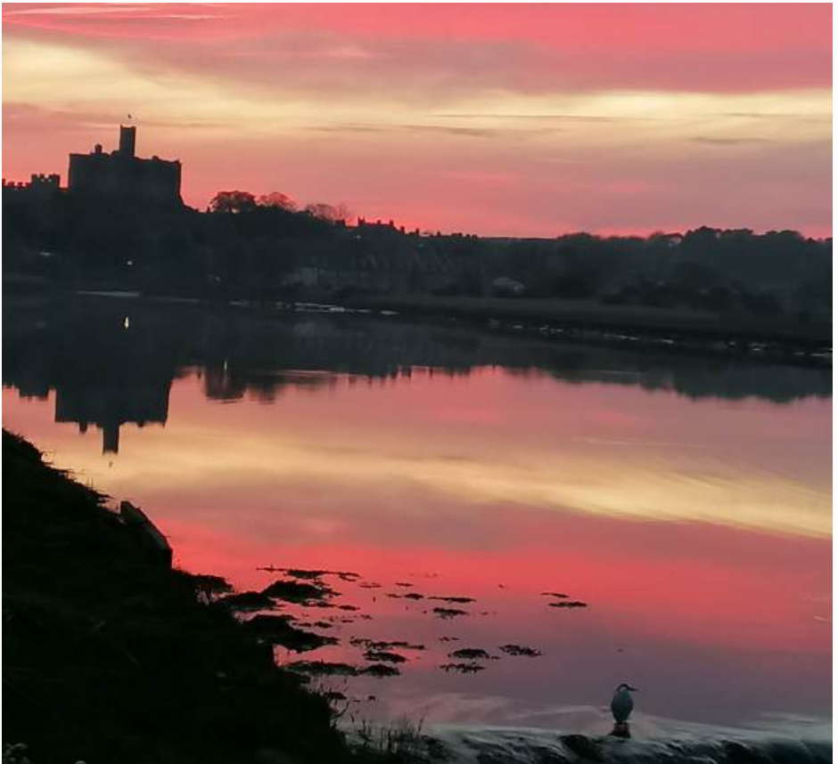
Warkworth Sunset