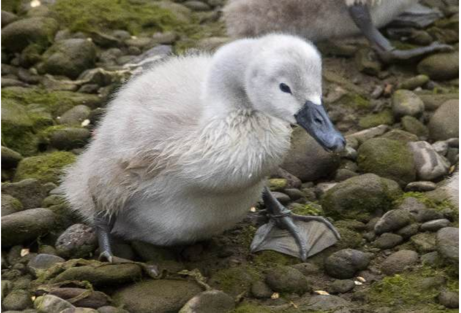
'A Little Wobble'