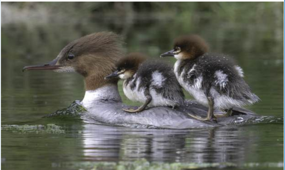
‘Hitching a ride’ A mother Goosander gives a lift to two of her ducklings.