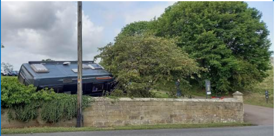
An interesting way of parking a camper van in the castle grounds!