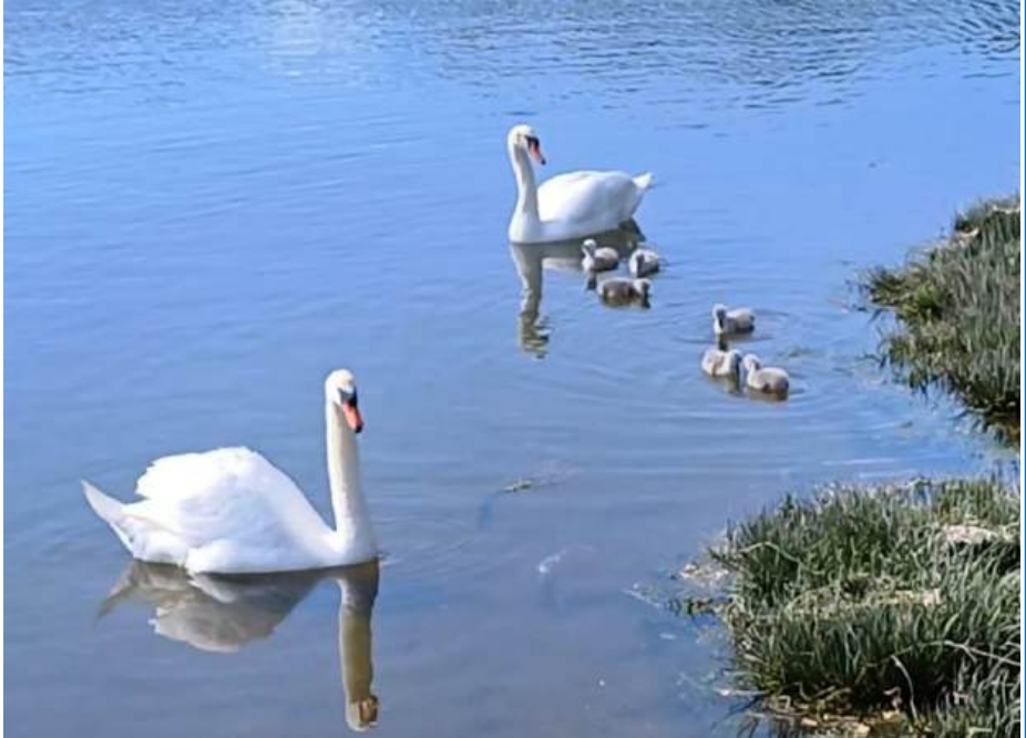
The Warkworth swans with their six cygnets on their second public appearance off the Butts.